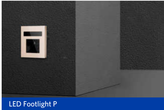
LED Footlight P